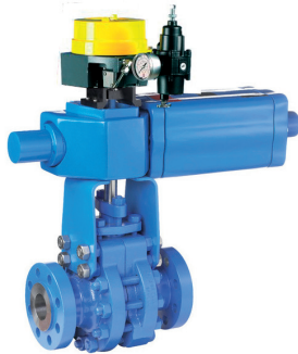
Trunnion mounted ball valve with intelligent SwitchGuard controller

Benefit – With over 20 years of experience, Metso has manufactured high pressure ball valves with full metal-to-metal sealing capability in Nickel based alloys to oxygen service. Metso offers also a unique powder metallurgical HIP process to produce high quality pressure retaining parts in Ni based alloys. Metso metal seated technology provides long term service-free valve operation with long lasting internal and external valve tightness.